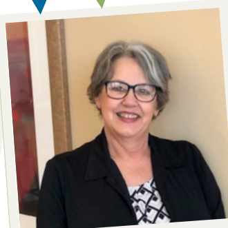
Lois (34 years) activities